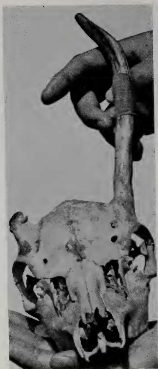
Fig. 16. Skull of fallow deer buck „Ł-5“

too abundant hair. On October 20th, the left antler was covered with abundant, thick hair and was about 18 cm long. Velvet shedding took place from October 25th to 29th, 1960. On the right side the chiselled surface remained unchanged all the time. In the places of grafting also no growth could be observed.